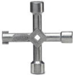
Control cabinet key, metal, for all common types of control cabinet

Please be informed that the data shown in this PDF Document is generated from our Online Catalog. Please find the complete data in the user's documentation. Our General Terms of Use for Downloads are valid ( http://phoenixcontact.com/download )