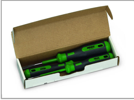
BSet of operating tools in a box

Subject to changes. Please also observe the further product documentation!